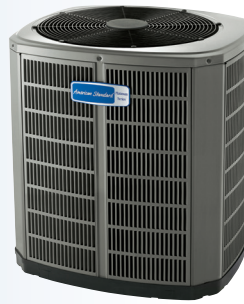
AccuComfort™ Platinum 18