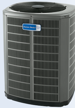
AccuComfort™ Platinum 20

American Standard Platinum air conditioners offer our highest combination of performance, efficiency, and temperature control. Built with American Standard's commitment to quality throughout, the Platinum line offers advanced energy-saving features like Duration™ variable speed compressors and Spine Fin™ coils.