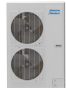
4 and 5 Ton Heat Pump