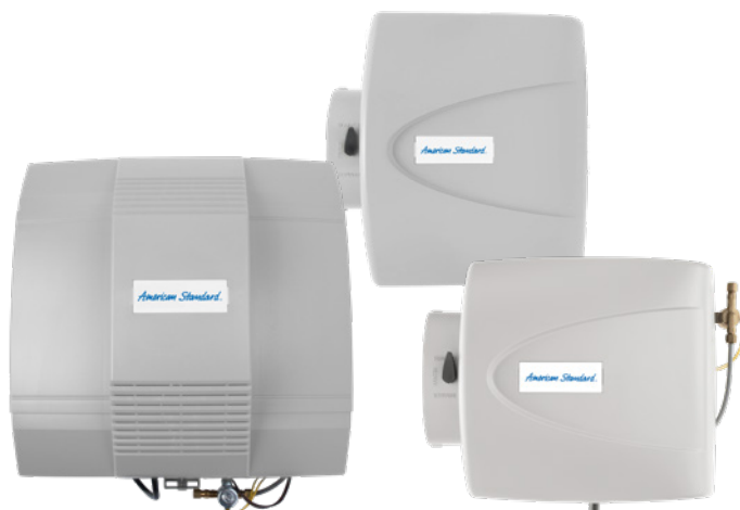
EHUMD500, EHUMD300, EHUMD200